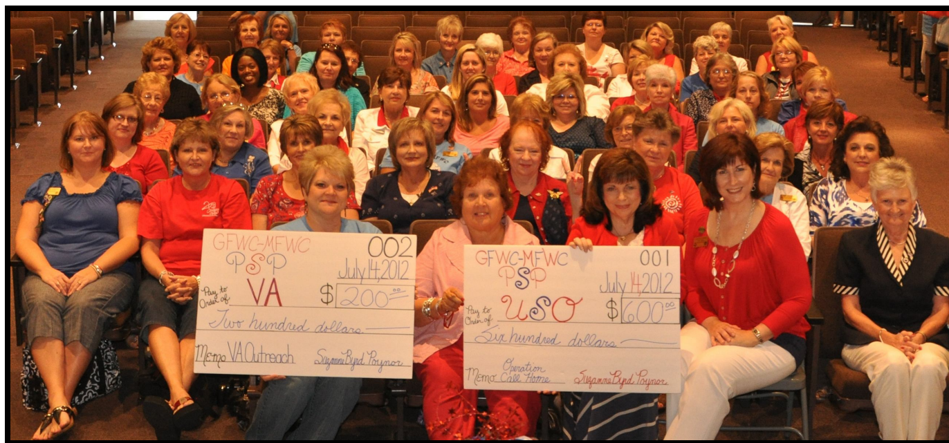
Executive Board Members and Club Presidents GFWC-MFWC Summer Institute ~ July 14, 2012 Mississippi Schools for the Blind and Deaf Jackson, Mississippi

NON-PROFIT ORG. POSTAGE PAID PERMIT #73 39759