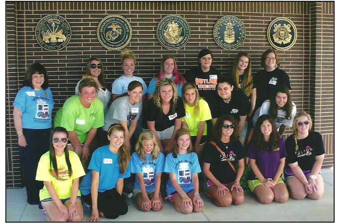
Visit to Mississippi Veterans Memorial Cemetery, Newton, Mississippi