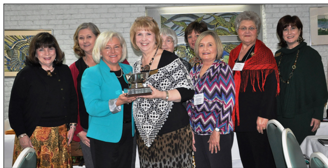
District II Club of the Year Decatur Woman's Progressive Club