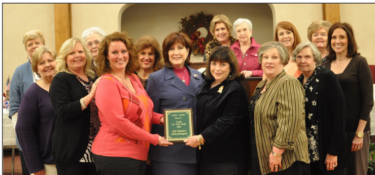
District I Club of the Year GFWC-MFWC Civic Woman's Club of Picayune