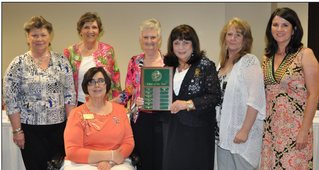
2012 Club of the Year GFWC-MFWC Fine Arts Club of Bruce