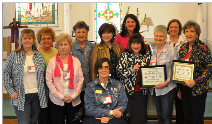
District III Club of the Year GFWC-MFWC Fine Arts Club of Bruce