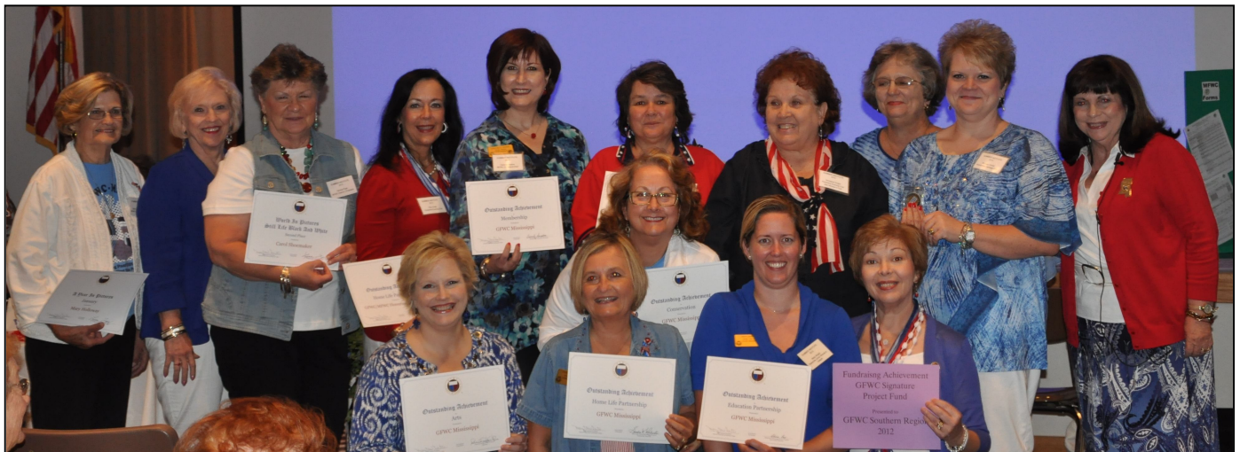
GFWC Winners Recognized at Summer Institute July 13, 2013