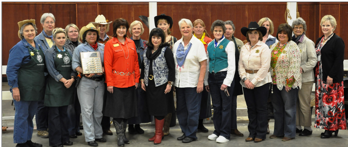
District V Club of the Year GFWC-MFWC Raleigh Woman's Club