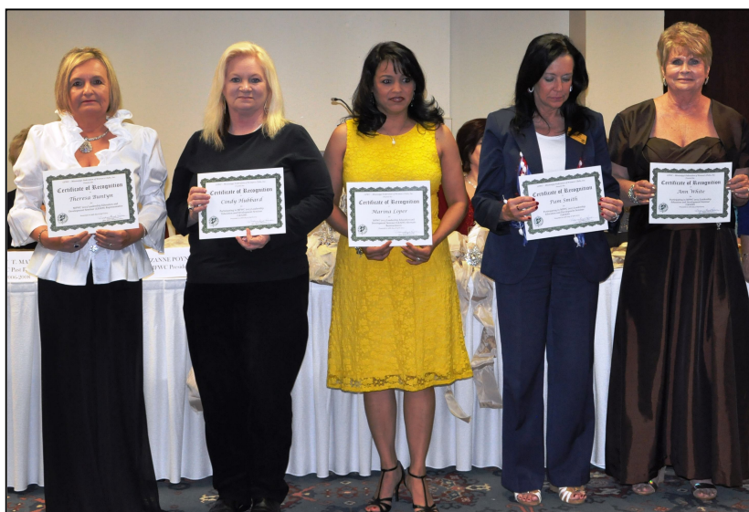
MFWC LEADS Participants (Seminar sponsored by the Malone-Sisk Education/Leadership Endowment)