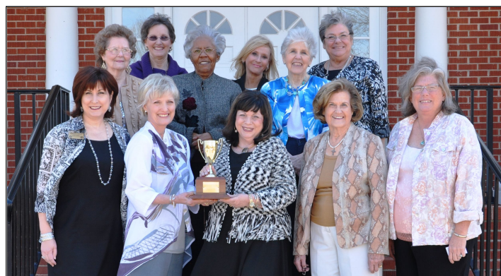
District IV Club of the Year GFWC-MFWC Batesville Woman's Club