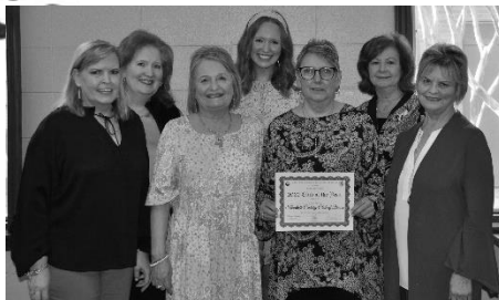
GFWC-MFWC Twentieth Century Club of Bruce 2022 Northern District Club of the Year