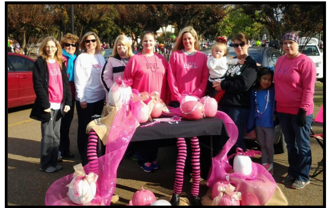
Members of the Batesville Junior Woman's League participated in "Scare on the Square" and distributed Breast Cancer Awareness materials.