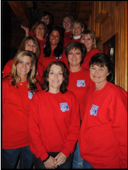
Members of GFWC-MFWC Twentieth Century Club of Bruce celebrated American Heart Month by wearing their red shirts to the February club meeting.