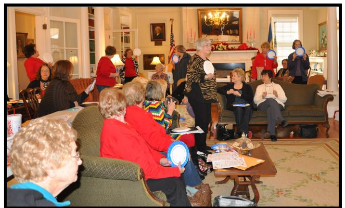
Board members play Heads or Tails game at Winter Board Meeting in February.