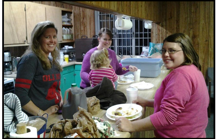
Batesville Junior Woman's League prepared and served a special lunch to local Veterans at VFW.