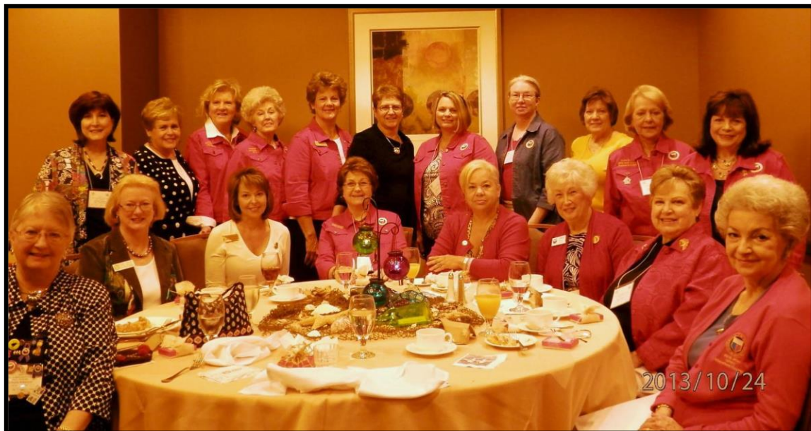
GFWC Southern Region Presidents and President-elects at Southern Region Breakfast hosted by GFWC-MFWC