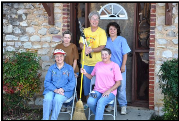
In conjunction with the Town of Raleigh, members of the GFWC-MFWC Raleigh Woman's Club cleaned up around the Vera Martin Community Center in Raleigh as a part of their Conservation efforts.