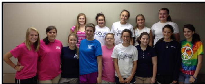
Dixie Daisy Juniorettes held a fundraiser and donated proceeds to assist Veterans' Clinics through the GFWC-MFWC Public Issues Partnership Program.