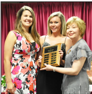
2011 Juniorette Club of the Year GFWC-MFWC Dixie Daisy Juniorettes