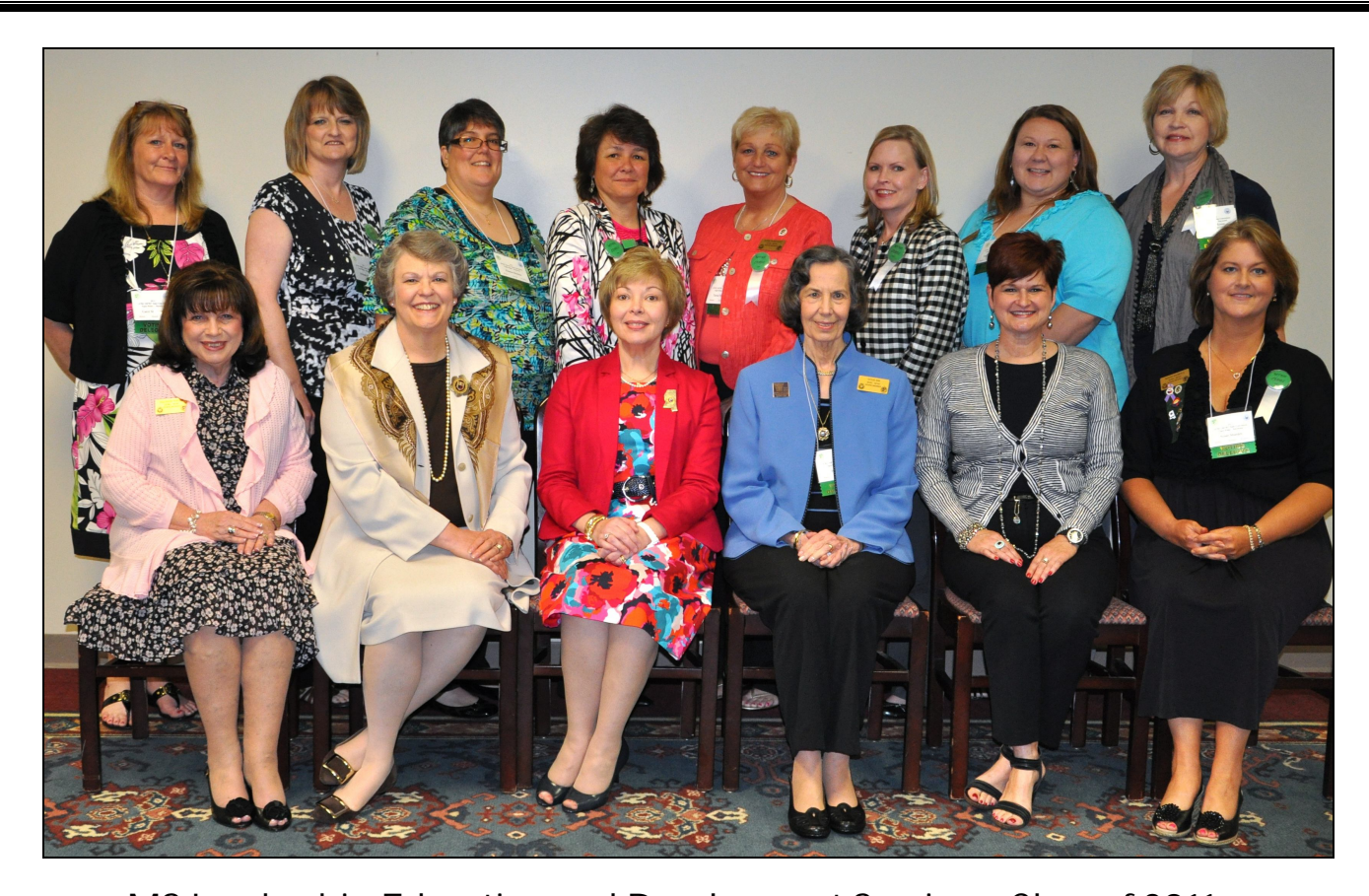
MS Leadership Education and Development Seminar, Class of 2011 Sponsored by the Malone-Sisk Education/Leadership Endowment

NON-PROFIT ORG. POSTAGE PAID PERMIT #73 39759