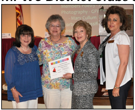
District II (Co Clubs) Decatur Woman's Progressive Club Quitman Woman's Club (not pictured)