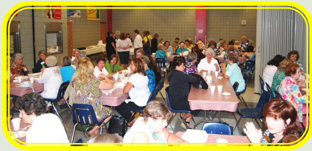
Left, Everyone enjoying a box lunch at SI.