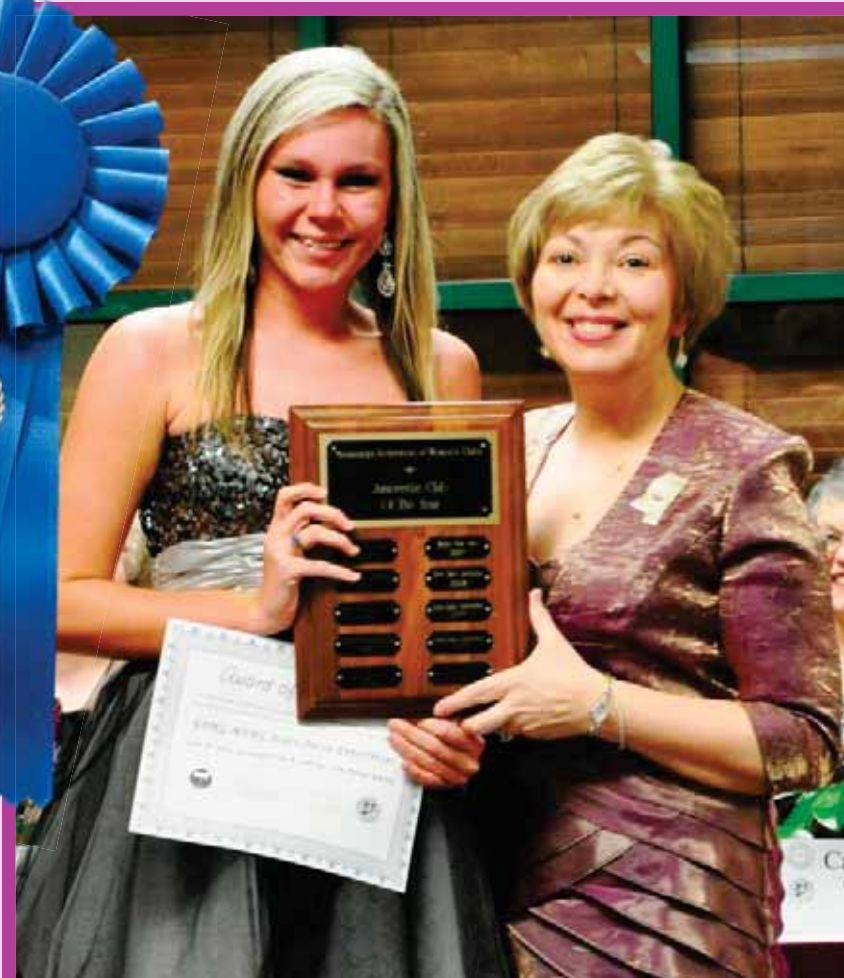
1st place - GFWC-MFWC Dixie Daisy Junioresses.